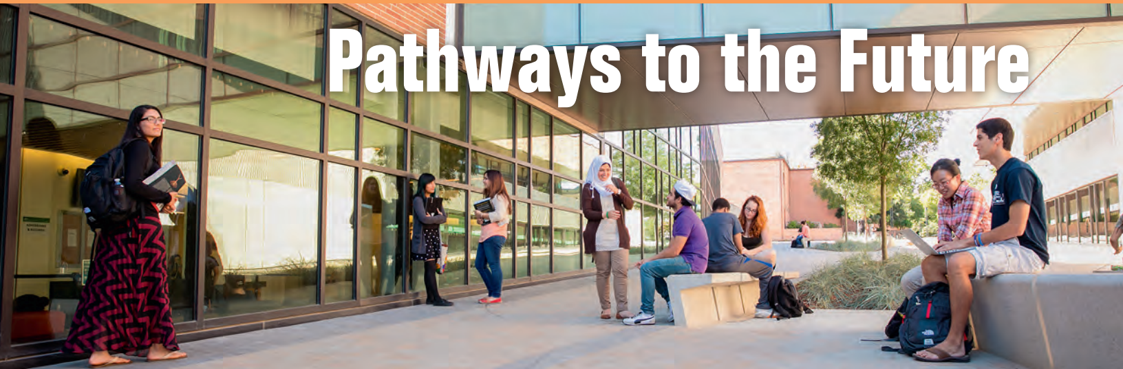
Top: Diablo Valley College students gather in the open space between the Commons' north and south wings. Center: Contra Costa College Center project construction is under way. Bottom: Los Medanos College students enjoying the campus Quad.