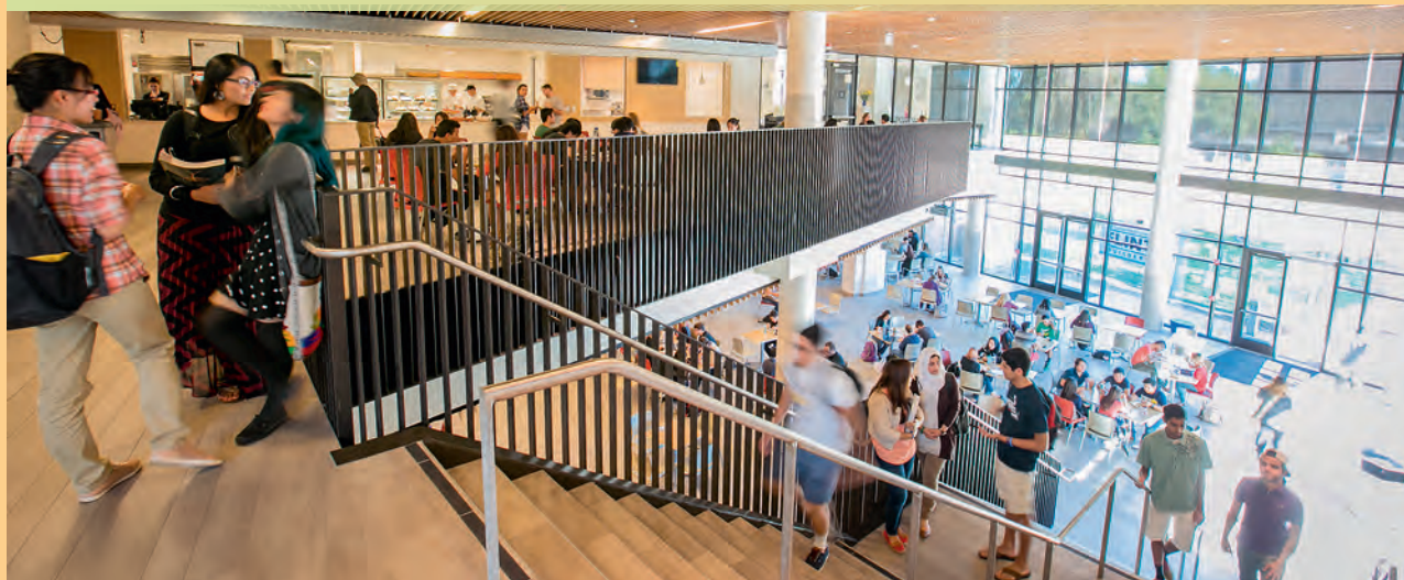
Diablo Valley College students enjoy the open feeling of the Commons' newly completed north wing, now called the Hospitality Services and Food Court, or HSFC building, offering a Food Court on the ground floor and Culinary Arts on the second floor.

Extensive information about the District's bond program, including project lists for all bond measures, is available on the District's website at www.4cd.edu/about/committees/measure_a/default.aspx . You'll also find copies of this annual report and past reports, and a current schedule of meetings of the Citizens' Bond Oversight Committee, which are open to the public. The next meeting of the Oversight Committee will be held on Wednesday, April 15, 2015, from 3 to 5 p.m. at Los Medanos College, 2700 East Leland Road, Pittsburg.