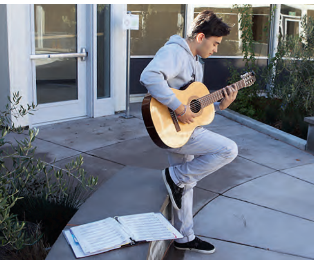
LMC Quad and new buildings (top); student practices in the CCC Music building atrium (above)