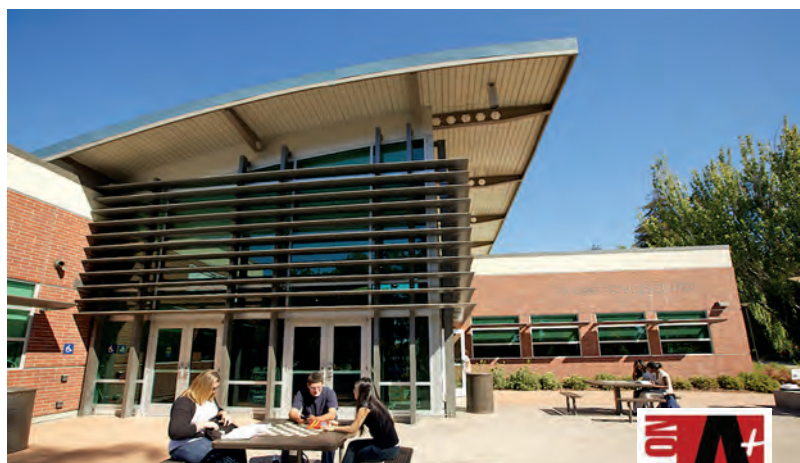
DVC Student Services Center building (above); CCC Student Services Center (above, right)

Major projects completed with 2006 funds include an impressive new Student Services Center and a Hospitality Services and Food Court building at DVC. At LMC, new Nursing and Medical Training classrooms and labs were constructed. In addition, all campuses are benefiting from athletic facilities renovations and ADA-compliant parking projects, along with energy management system and information technology upgrades Districtwide.