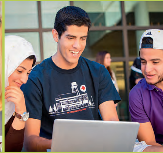
Students on Contra Costa Community College District campuses